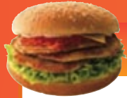
TRIPLE FILLET BONDİ BURGER (300G)