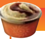
MASHED POTATO & GRAVY (206G)