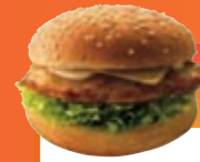
SINGLE FILLET NORM BURGER (306G)