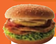
OTOPRO BURGER (300G)