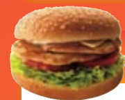
DOUBLE FILLET OPREGO BURGER (280G)