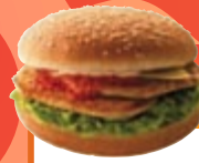
DOUBLE FILLET BONDİ BURGER (260G)