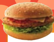
SINGLE FILLET BONDİ BURGER (306G)