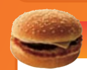
BURGER SNACKER (306G)