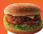
VEGGIE BURGER (270G)