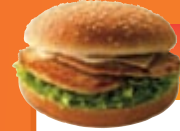
DOUBLE FILLET NORM BURGER (260G)