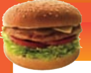
SINGLE FILLET OPREGO BURGER (706G)