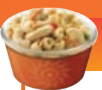
PASTA SALAD (106G)