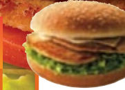
TRIPLE FILLET NORM BURGER (300G)