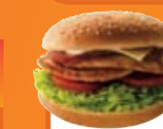
BLT BURGER (283G)