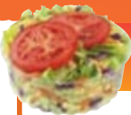
GARDEN SIDE SALAD NO DRESSING (270G)